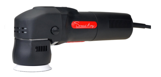
Scratch Away SAW195 Polisher