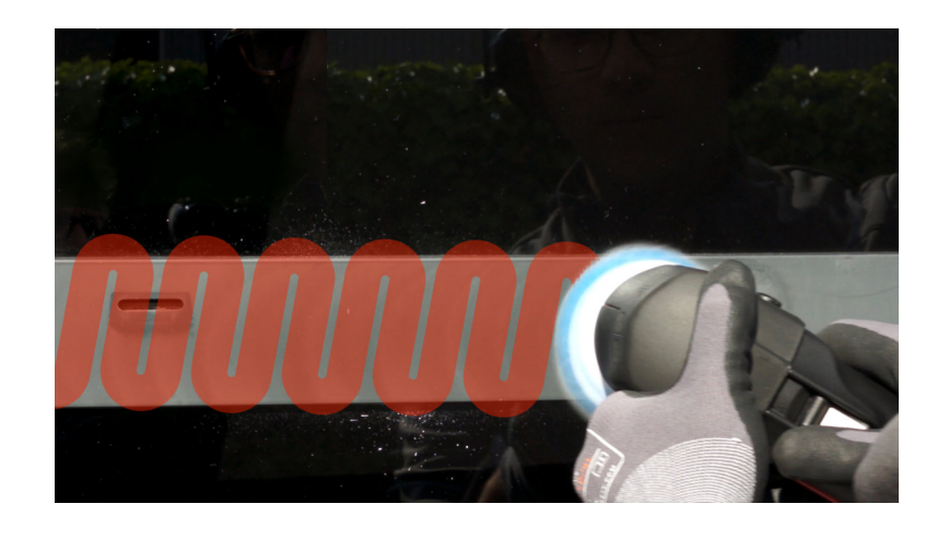
Make S turns while polishing