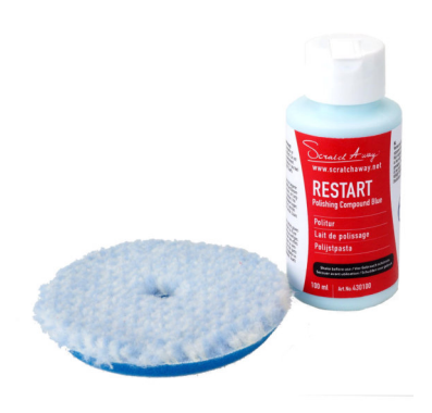
RESTART polish with polishing disc Blue