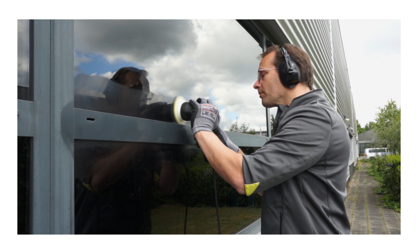
Also the edge of the frame