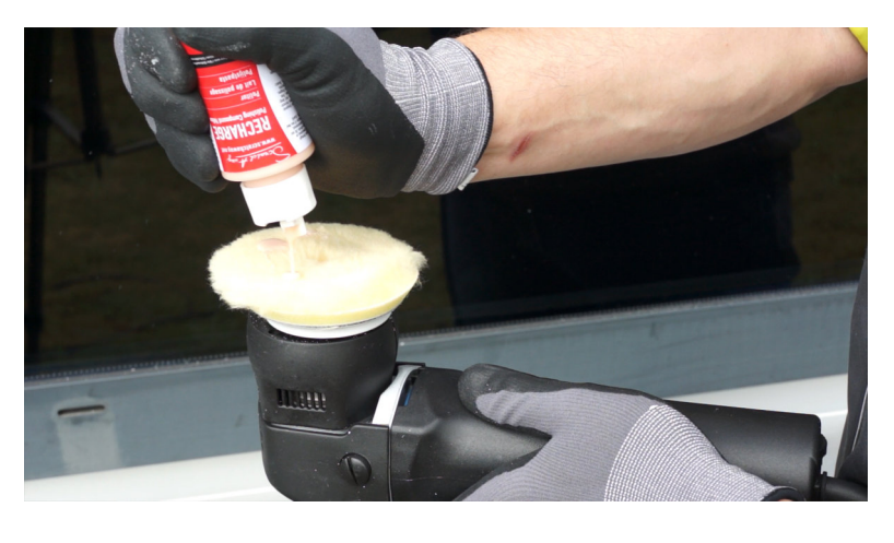
STEP 2 Polishing compound RECHARGE on polishing disc yellow