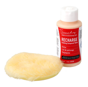
RECHARGE polish with polishing disc Yellow