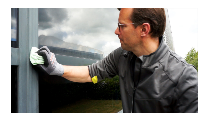
STEP 4 Rub with a clean, dry cloth

After a surface has been completely renovated. We advise to maintain the surface every 2 years after proper cleaning, with the yellow RECHARGE polish. In order to provide protection for the coming period to come.